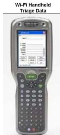
Wi-Fi Handheld Triage Data DMS Wi-Fi Handheld Patient Triage Data

Through the use of the Warrior HotSpot, the first responders in each medical aid station were able to scan patients into the Emergency Patient Tracking System with Wi-Fi enabled scanners loaded with EPTS Software. Each patient is assigned a unique number and triage category. Some of the additional information that can be gathered for each patient may include the following: chief complaint, vital signs, disposition, and destination. The data gathered from each patient is then transmitted wirelessly from the handheld scanners to a secure website via the cellular-enabled wireless routers and Warrior HotSpots. The core technology for the EPTS was developed by Disaster Management Solutions .